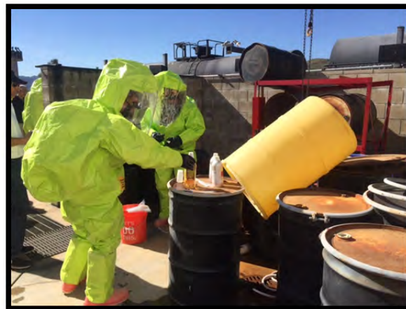
Level “A” Suits