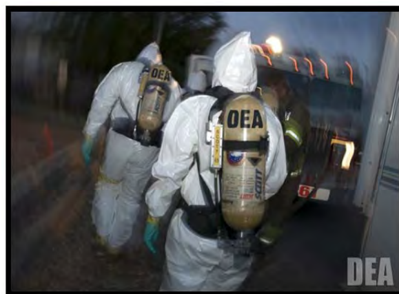
Level “B” Suits

First responders who may encounter fentanyl or fentanyl-related substances should maintain an individual (personal) PPE kit, which includes: